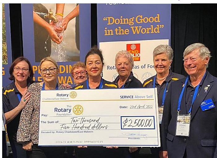
Chadstone-East Malvern and their "big cheque"