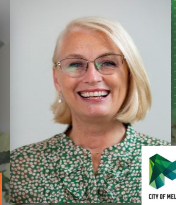
Lord Mayor Sally Capp