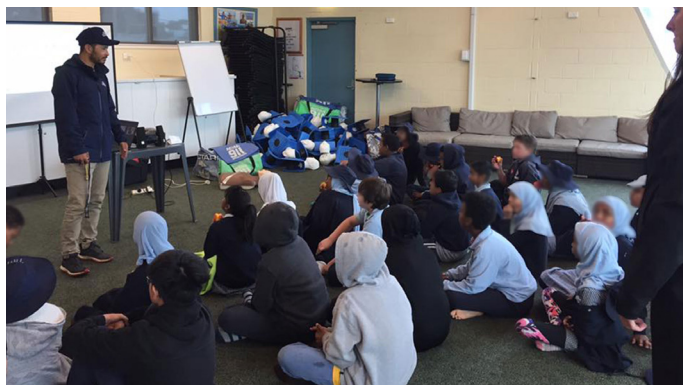
Students learning about CPR at a swimming and safety program funded by the Rotary Club of Carlton (RCC).

In Australia, there are 1,100 Rotary clubs, one of which is The Rotary Club of Carlton. Since 1985, the Rotary Club of Carlton has supported innumerable international, national and local projects. These include the Ronald McDonald House, Carlton Junior Football Club, swimming and safety lessons for refugee children, Carlton Primary School, the National Youth Science Forum, the Rotary Youth Leadership Award, the Rotary Youth Program of Enrichment, homeless services for young people, Mental Health First Aid courses in high schools, support of Australian Rotary Health’s mental health research, Rotary programs against polio and malaria, and education of girls in Afghanistan.