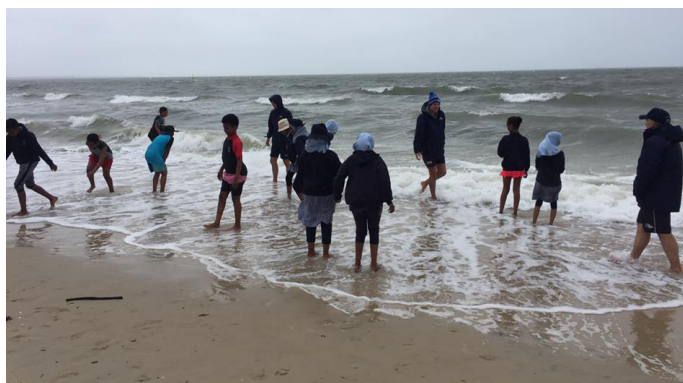
Carlton Primary School at the beach with RCC.

Rotary then — to answer the question ‘What is Rotary?’ — is when the simple and small things collide with the best of intentions to serve humanity and to be a Rotarian is simply is to have a desire to do something good to help others and a make a difference.