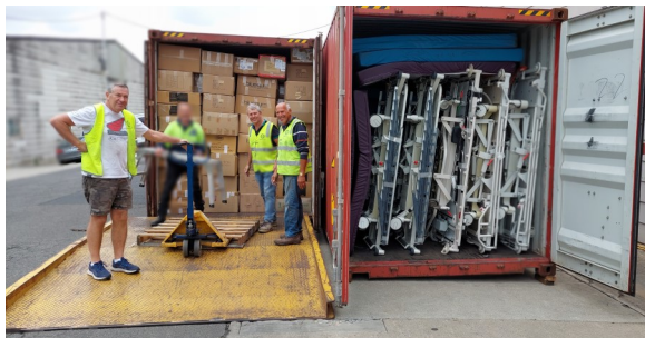
The “tetris magicians” how many beds can we fit into a container?

In particular, the project aimed to provide medical equipment to local hospitals that were in dire need, and to support locals who would otherwise travel long distances to receive the basic medical care that they needed. The beneficiaries of these donated resources include Jig-jiga University Sheik Hassen Referral Hospital and Harar Regional State Health Bureau Jugel General Hospital.