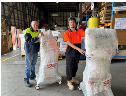
Here are 28 ventilators arriving.