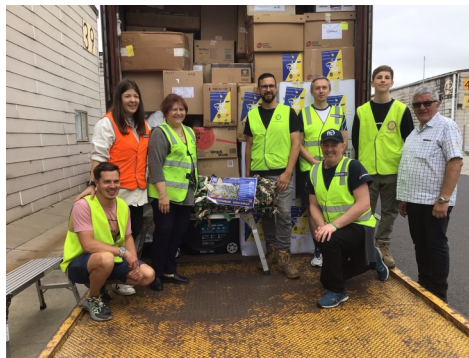
Some of the Ukrainian volunteers