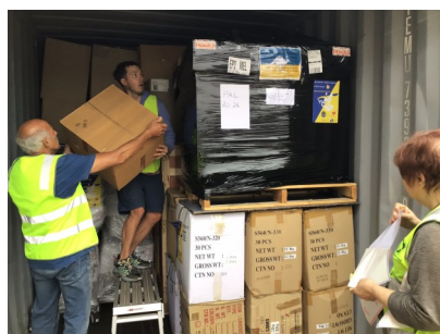
Loading in—muscles required